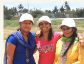
Women associates participating in 'Spardha', the internal sporting event