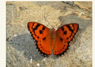
Biodiversity study at Happinest, Boisar.