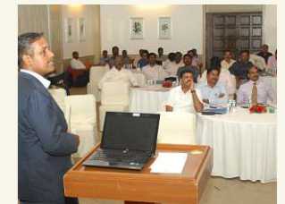
Supplier Meet, South for capacity building