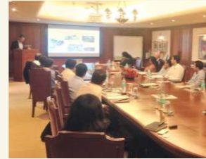
Meeting with investors on Mahindra Lifespaces' sustainability approach