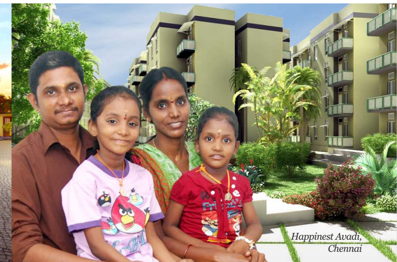
Happinest Avadi, Chennai

2,000+ Affordable Homes Spread Over 25+ Acres