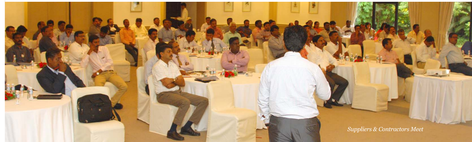
Suppliers & Contractors Meet

With half of the world's population living in urban areas and the other half increasingly depending upon cities for economic progress, Urbanisation cannot happen in isolation and calls for mass adoption. As pioneers of sustainable development in India, we engage with policy makers, planners, practitioners and academia to promote responsible urbanisation and evolve sustainable frameworks that can collectively nurture the future of our cities.