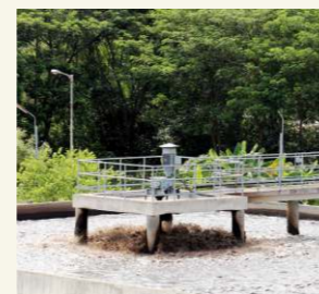
Reducing freshwater requirement through recycling