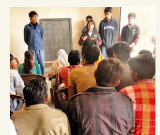
Enhancing employability of youth through vocational training