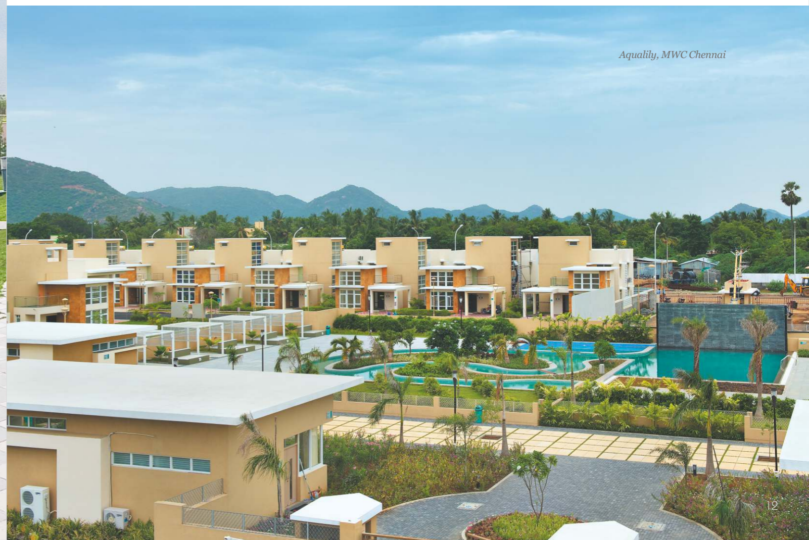
Aqualily, MWC Chennai

We are expanding our construction footprint, while shrinking our environment footprint. We are improving our project timelines, while innovating with construction best practices. We are maximising the quality of life while optimising the consumption of every unit of resource - through reduction, reuse and recycling.