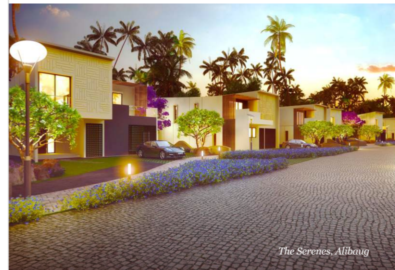
The Serenes, Alibaug

Over 15 million sq.ft. Green Residential Footprint*