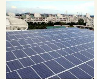
75 Kw Rooftop Solar system installed at MWC, Chennai