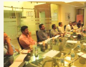
Focus Group Discussion (FGD) on how to make Mahindra Lifespaces a Great Place To Work