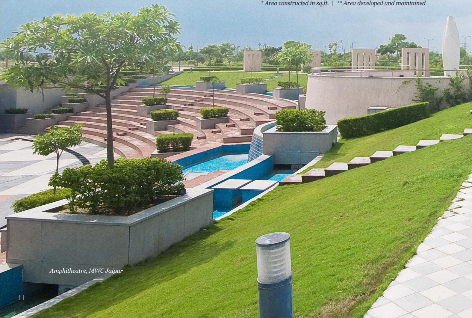
Amphitheatre, MWC Jaipur

MLIFE - Mahindra Lifespaces | MWC - Mahindra World Cities * Area constructed in sq.ft. | ** Area developed and maintained